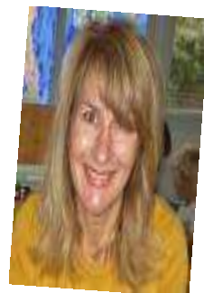
Marion PFA Mon, Tues & Thurs