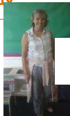
Louise DSL PFA