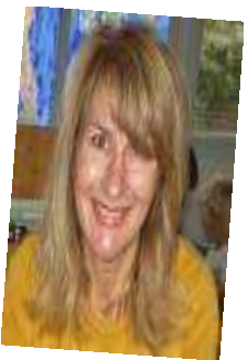
Marion PFA Mon, Tues & Thurs