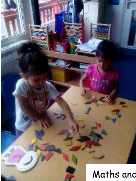
Maths and Literacy already being explored with shapes and letters.