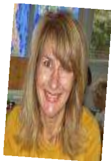
Marion PFA Mon, Tues & Thurs