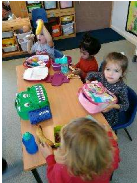
And ofcourse lunch. This week is was lunch brought from home next week it will be in the school hall!